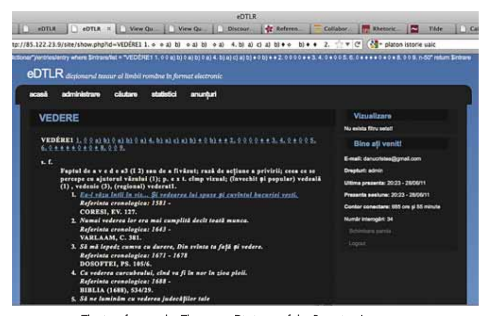
The interface to the Thesaurus Dictinary of the Romaian Language

The HTML/Word format saved by the proofreading interface was cleaned by formatting garbage and brought to a lexicographic standard (XML-TEI) by a parser (2). The parser implemented a three steps process. In the first step a configuration of markers is used to identify the different types of fields in the entries. The sense tree of each entry is then determined by exploiting another level of markers and, finally, the atomic definitions (fine-grained senses) are extracted by means of a third level of markers. As such, the parser first identifies the sense markers in a breadth-first manner, and only afterwards builds the sense tree. This strategy, although resembling other known approaches for dictionary parsing (for instance the one used by the French TLFI), brings as a novelty the hierarchical arrangement of the markers, declaratively separated from the parser code. The structures thus obtained have a high degree of