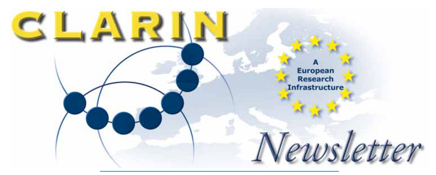
Number 13, 2011, January-June