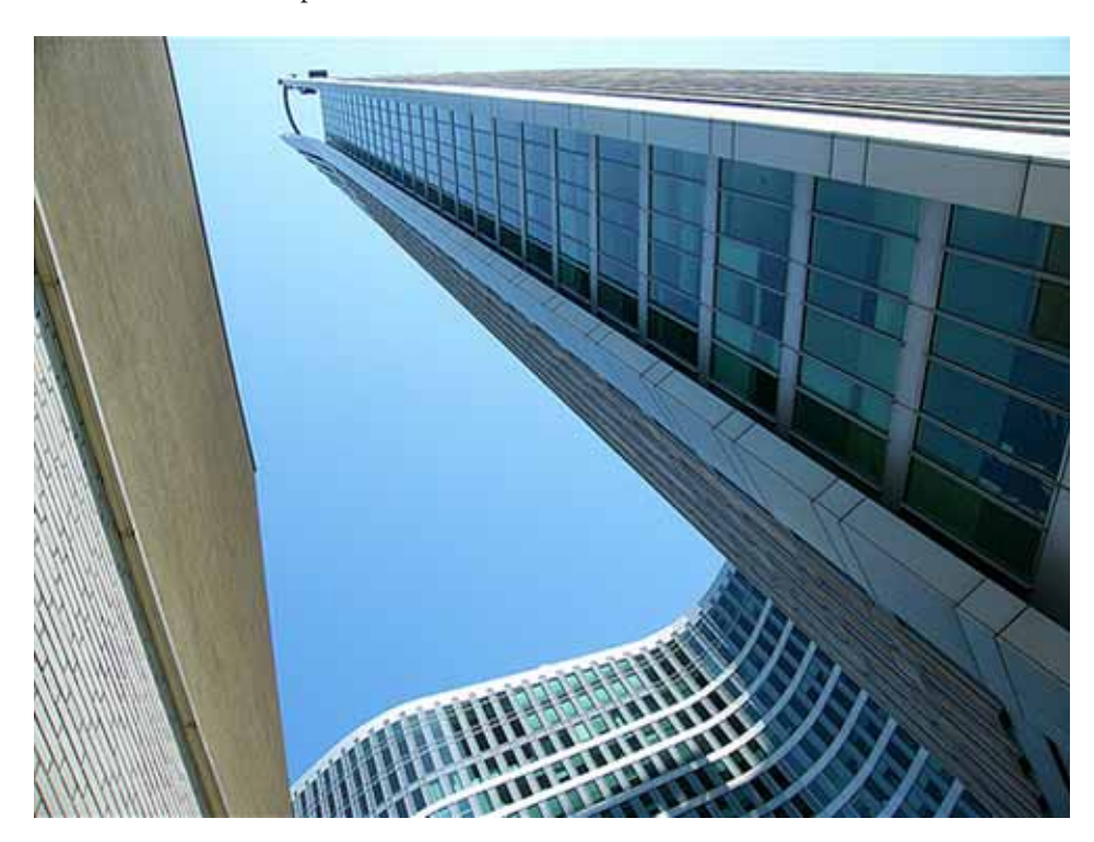
The building of the Ministry of Education, Culture and Science of the Kingdom of Netherlands

The CLARIN-EU preparatory project is now about to finish. The formal application for the CLARIN ERIC, which the Netherlands will host, has been submitted, and we are confident that CLARIN can become a success. National activities in other countries have also started up or are about to start, and we look forward to working together again with all CLARIN partners, with which we have had a very fruitful cooperation (and fun!) in the preparatory project when working on the CLARIN infrastructure. \Box