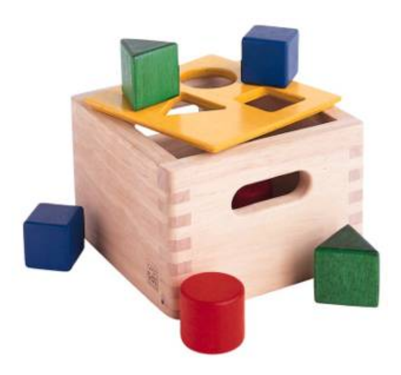
Figure 2.2: Box and blocks analogy from childhood memory: the holes on one end correspond to input templates, the holes on the other end correspond to output templates. Imagine blocks going in through one and out through the other. The blocks themselves correspond to input or output files with attached metadata. Profiles describe how one or more input blocks are transformed into output blocks, which may differ in type and number. Granted, I am stretching the analogy here; your childhood toy did not have this magic feature of course!

value, unassign a value, or copy a value from an input template or from a global parameter. Through these templates, the actual metadata can be constructed. Input templates and output templates always have a label describing their function. Upon input, this provides the means for the user to recognise and select the desired input template, and upon output, it allows the user to easily recognise the type of output file. How all this is specified exactly will be demonstrated in detail later.